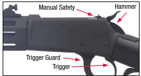
FIG 3: RIGHT-SIDE