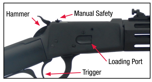
FIG 4: LOADING